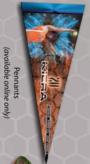
Pennants (available online only)