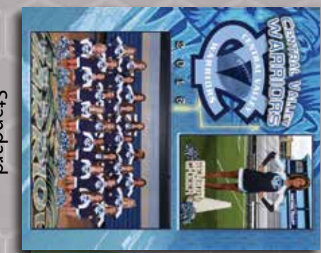
Standard Memory Mate