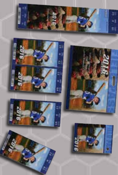
Magnetic Game Day Pack