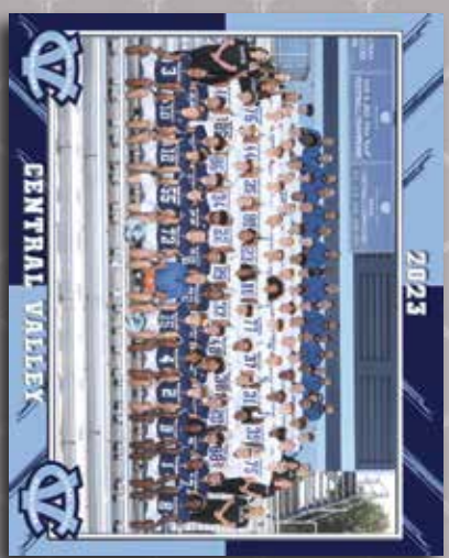
Custom Group Photo