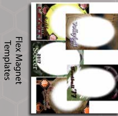
Flex Magnet Templates