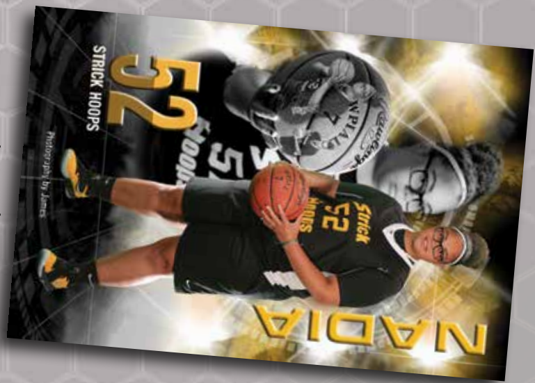
Specialty Vinyl Banner (available online only)