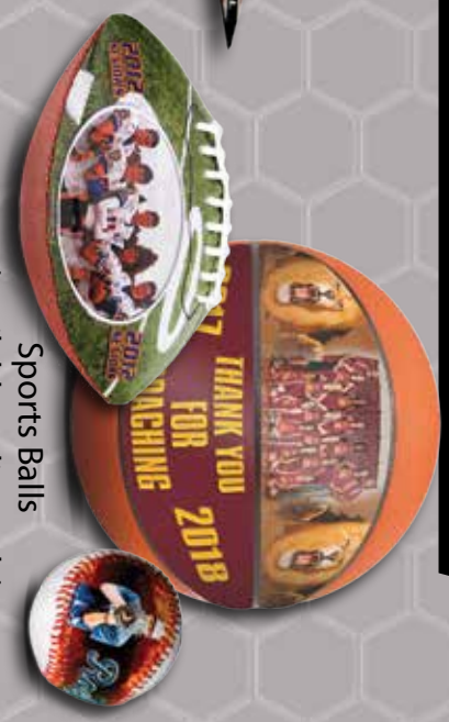
Sports Balls (available online only)